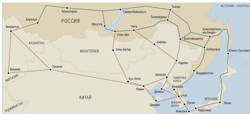
Fig. 1. The «small» Asian energy ring [7].

The formation of the Asian energy ring – the unification of energy systems of Russia, South Korea, China and Japan – according to the Ministry for the development of Russian Far East is estimated to cost 30 billion dollars (Fig. 1).