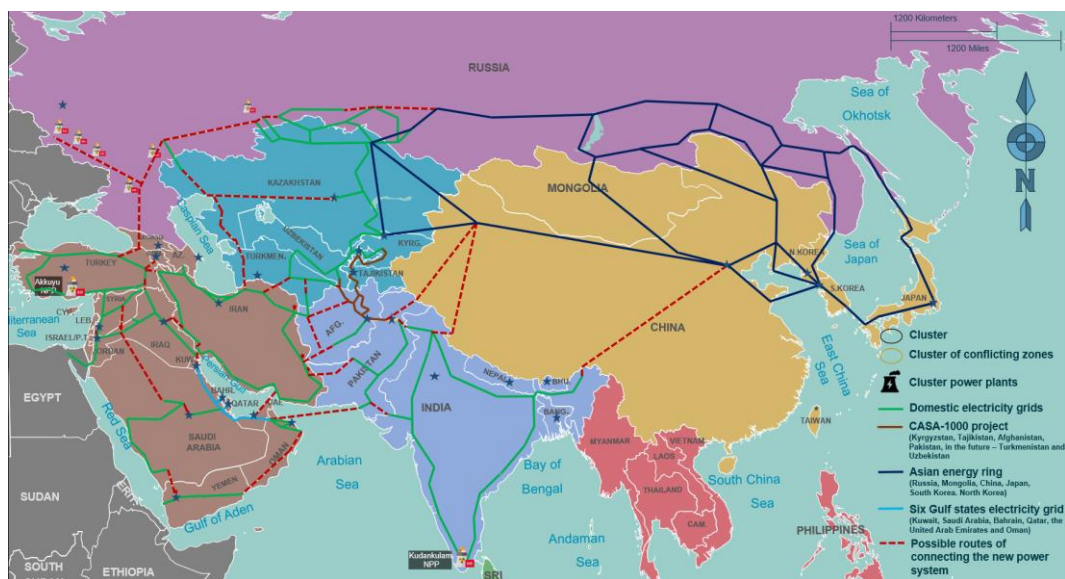
Fig. 3. The Global Asian energy ring [10].

The main proposal is to expand the “broad” Asian energy ring within the group of energy clusters of Eastern, Southern and Western Asia into a unified super power grid – the Global Asian energy ring (Fig. 3).